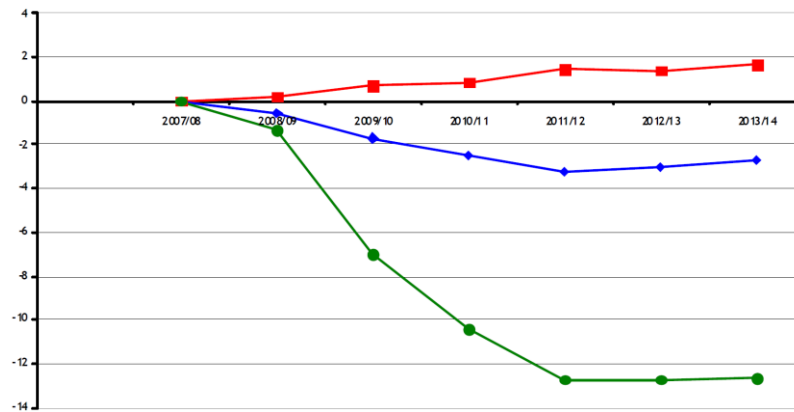
Figure 1: Percentage variation in pupils (top line), classes (middle line) and teachers (bottom line) compared to school year 2007/2008

103